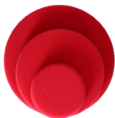
POP 308-318 Red

Finixa has a great range of compounding and polishing pads to suit all tasks, from heavy cutting to fine polishing.