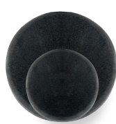
POP 908-914 Black