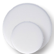
POP 508-514 White