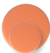
POP 708-714 Orange